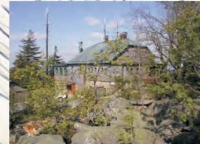
Kösseine 932 a.s.l.