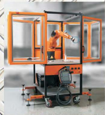
KUKA Training cell